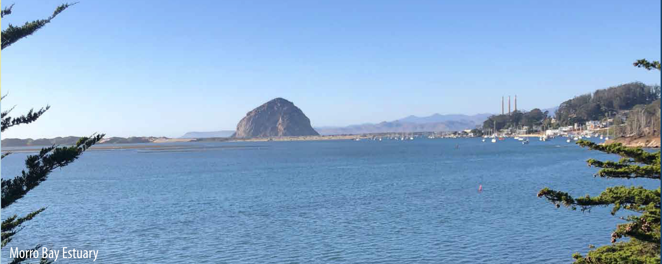
Morro Bay Estuary