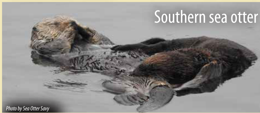
Southern sea otter

Once common, more than 95% of California's wetlands have been filled or developed, making it crucial to conserve these ecologically rich habitats.