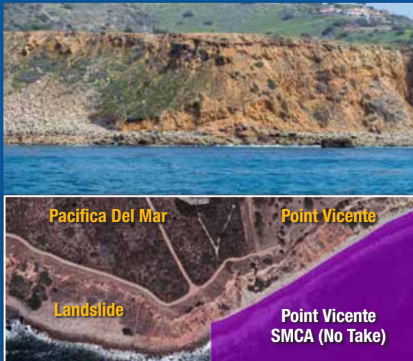
Point Vicente SMCA (No Take)- Northwestern Boundary