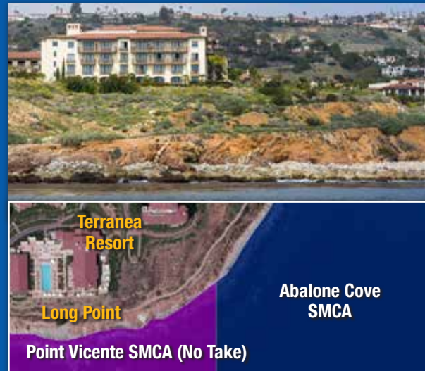
Boundary between Point Vicente SMCA (No Take) and Abalone Cove SMCA