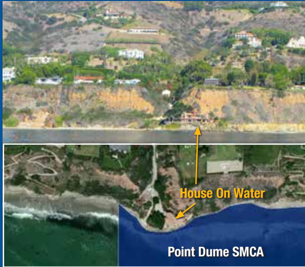
Point Dume SMCA- Upcoast Boundary

This document is provided as a courtesy only and photos are not intended for navigational use. Use GPS coordinates to determine the exact location of MPA boundaries.