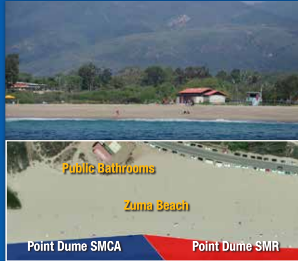
Boundary between Point Dume SMCA and Point Dume SMR