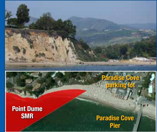
Point Dume SMR- Downcoast Boundary