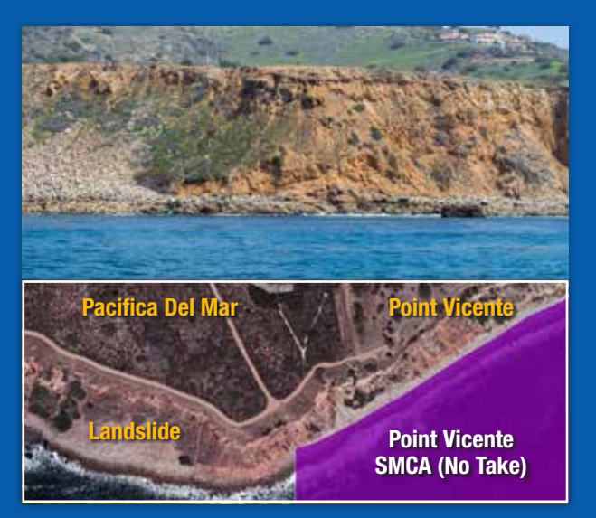
Point Vicente SMCA (No Take)- Northwestern Boundary