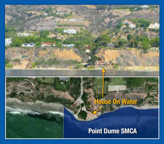
Point Dume SMCA- Upcoast Boundary

This document is provided as a courtesy only and photos are not intended for navigational use. Use GPS coordinates to determine the exact location of MPA boundaries.