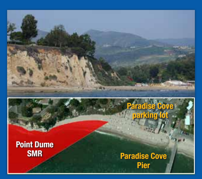
Point Dume SMR- Downcoast Boundary