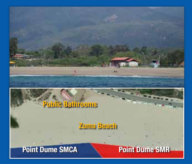
Boundary between Point Dume SMCA and Point Dume SMR